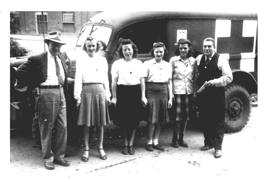
A 1940s photograph of Red Cross members in Cohoes.